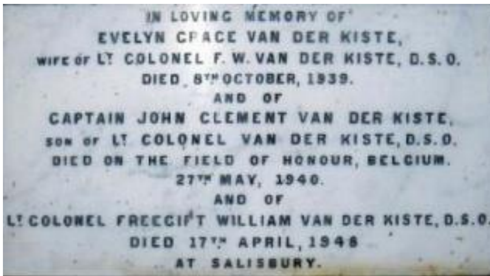
Memorial Plaque in Limerick Cathedral, Ireland

During the war he was a Captain in the 2nd Battalion, North Staffordshire (Prince of Wales) Regiment, Service No. 38773. He died on the 27 th of May 1940, the date when the Dunkirk evacuation began. He is buried at Oosttaverne Wood Cemetery, Heuvelland, West Vlaanderen, Belgium.