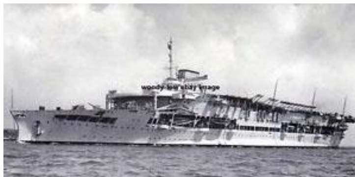
HMS Glorious as an Aircraft Carrier

Glorious was a converted Courageous -class cruiser that had served in World War I in its original role. During the 1920s, the ship was converted into an aircraft carrier as a result of the Washington Naval Treaty of 1922. The high speed needed to potentially outrun enemy ships, the heavier takeoff weight of naval aircraft and the large hull, which made cruisers perfect candidates for conversion to aircraft carriers. After World War I and her conversion to a carrier, Glorious spent the majority of her career serving in the Mediterranean, with a brief sojourn during World War II into the Indian Ocean with Force J to try and locate the German pocket battleship Admiral Graf Spee .