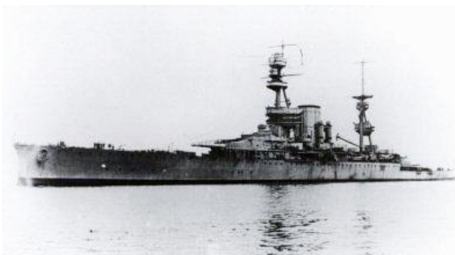
HMS Glorious as a Battlecruiser